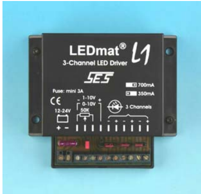
LEDmat® 3-Channel Power LED Driver, 1-10V, 0 - 10V / Poti, Abmessungen / dimensions: 99 x 89 x 41mm